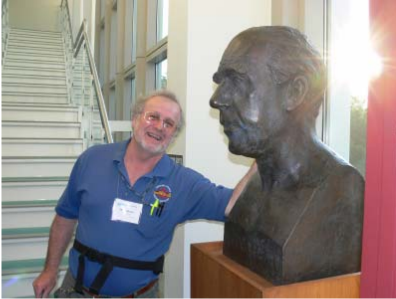
A bust of Niels Bohr stands guard over the Niels Bohr library.